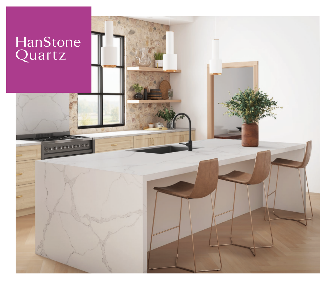
CARE & MAINTENANCE