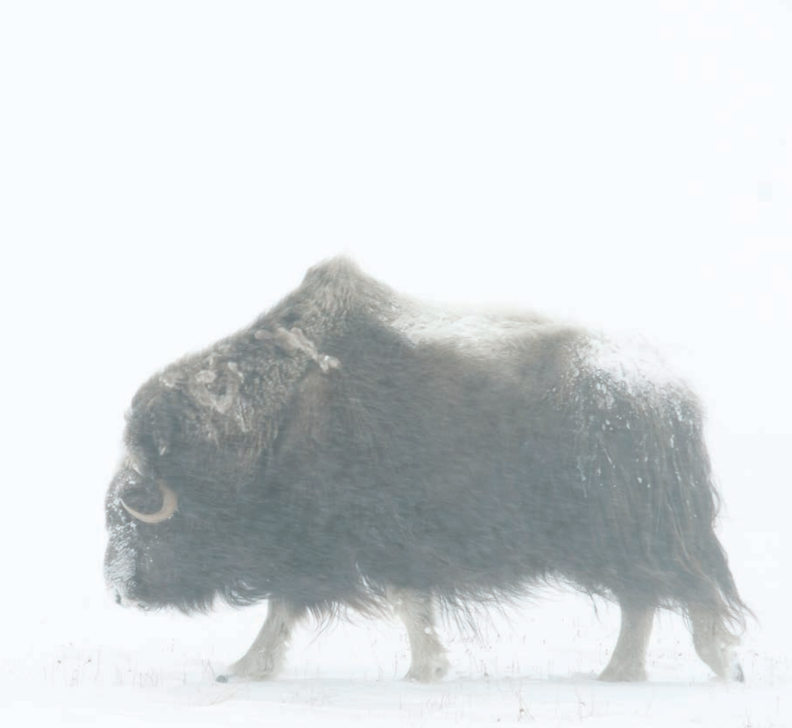
Musk Ox in Snow Storm, Banks Island, British Columbia